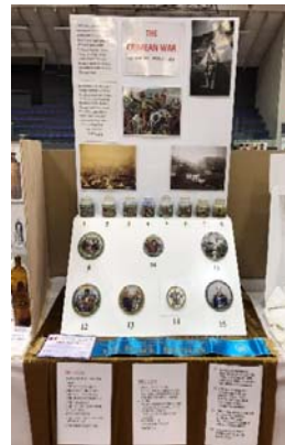
Neil's Crimean War