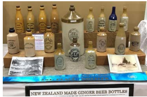
Sean's Ginger beers