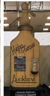
Dave & Cheryl WA

On the whole the Christchurch collectors did very well with many prizes and ribbons heading South I felt very privileged to have won the collectables category as well as best collectable display and best overall display with my Loo tiques display ( I guess its something we've not seen before at our shows).